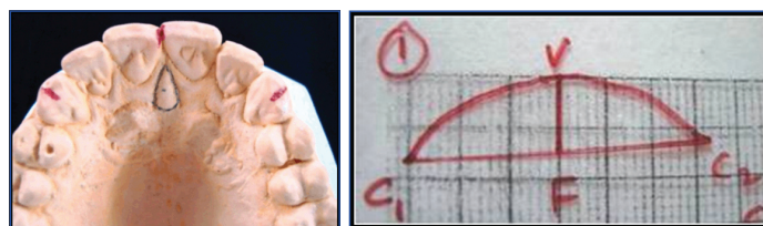
[Table/Fig-1]: Marking of mesial incisal edges of central incisors and canine tips on cast. [Table/Fig-2]: Markings transferred on graph paper in which C 1 and C 2 are the canine tips, V is the mesial edge of the central incisor and F is the line drawn \perp from V to C 1 and C 2 .

distance while no significant difference revealed between the comparison of tapered and square arch forms [Table/Fig-8].