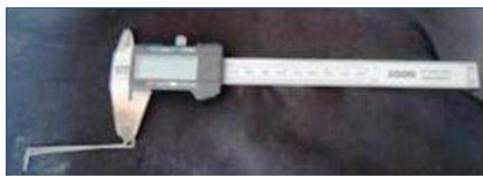
[Table/Fig-5]: Orthodontic wire straightened and bent at right angle which is soldered to each arm of Vernier's caliper.